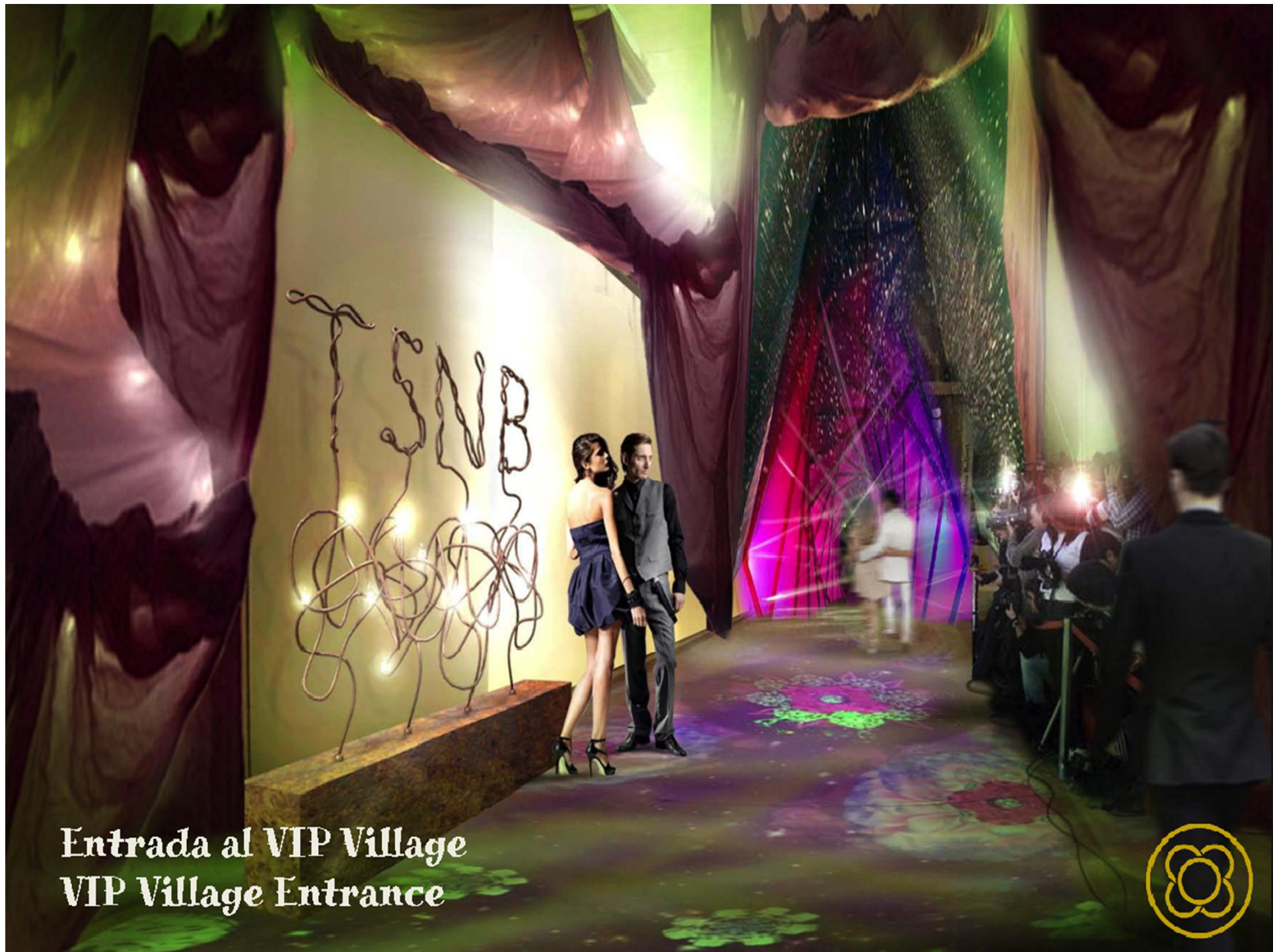
Entrada al VIP Village VIP Village Entrance